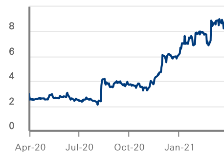
Price (in EUR)